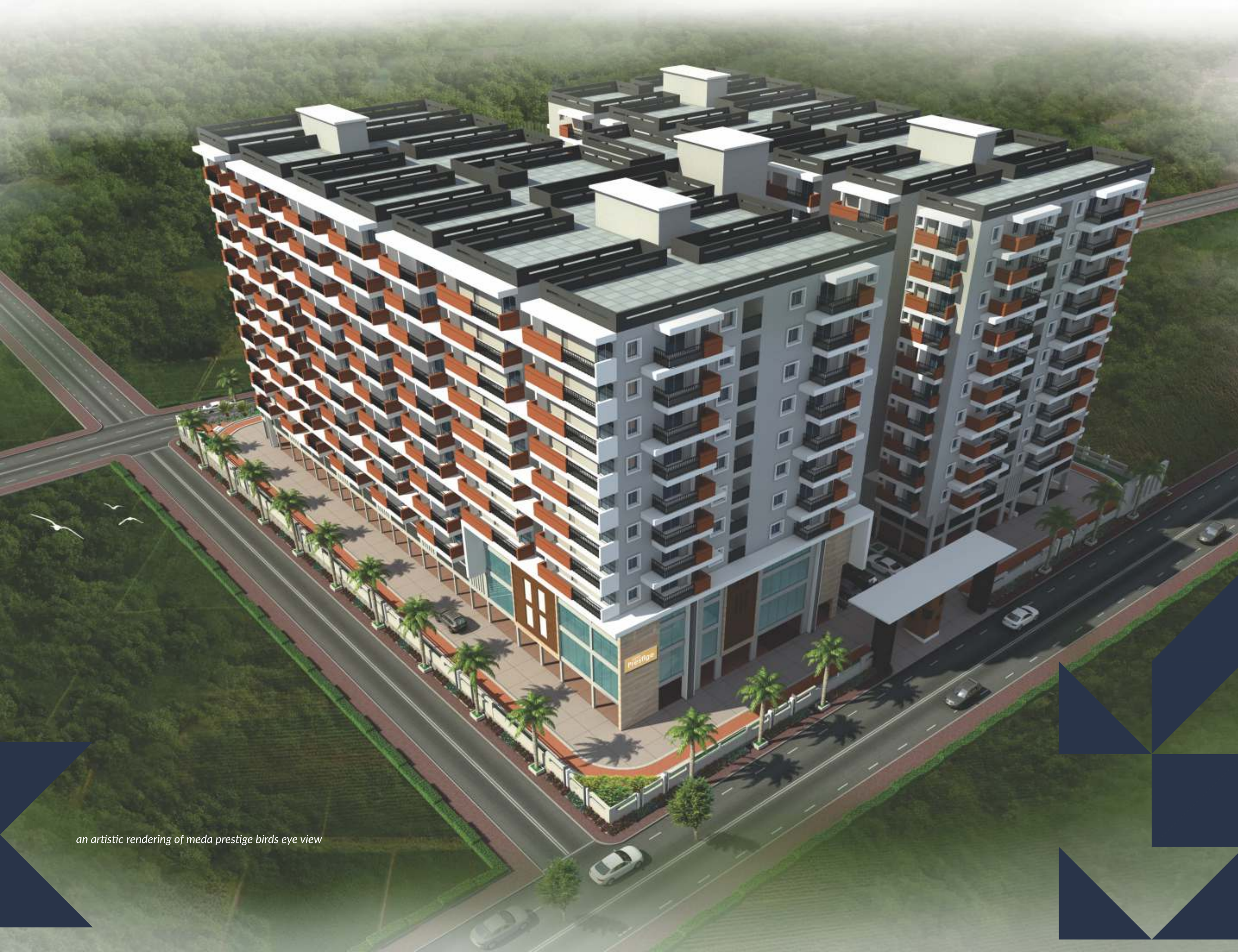
an artistic rendering of meda prestige birds eye view