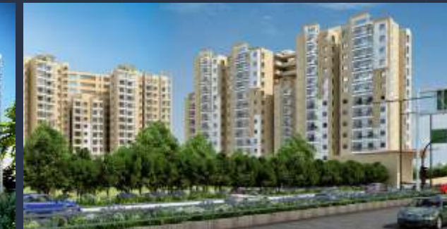
Meda Heights, Bangalore