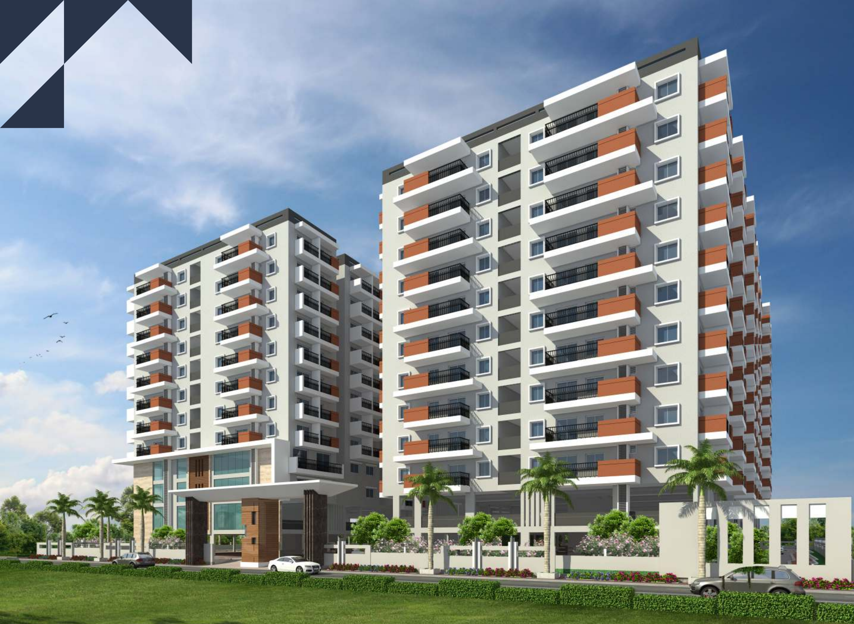
an artistic rendering of meda prestige front view