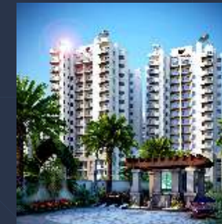
MRKR Mera Homes, Bangalore