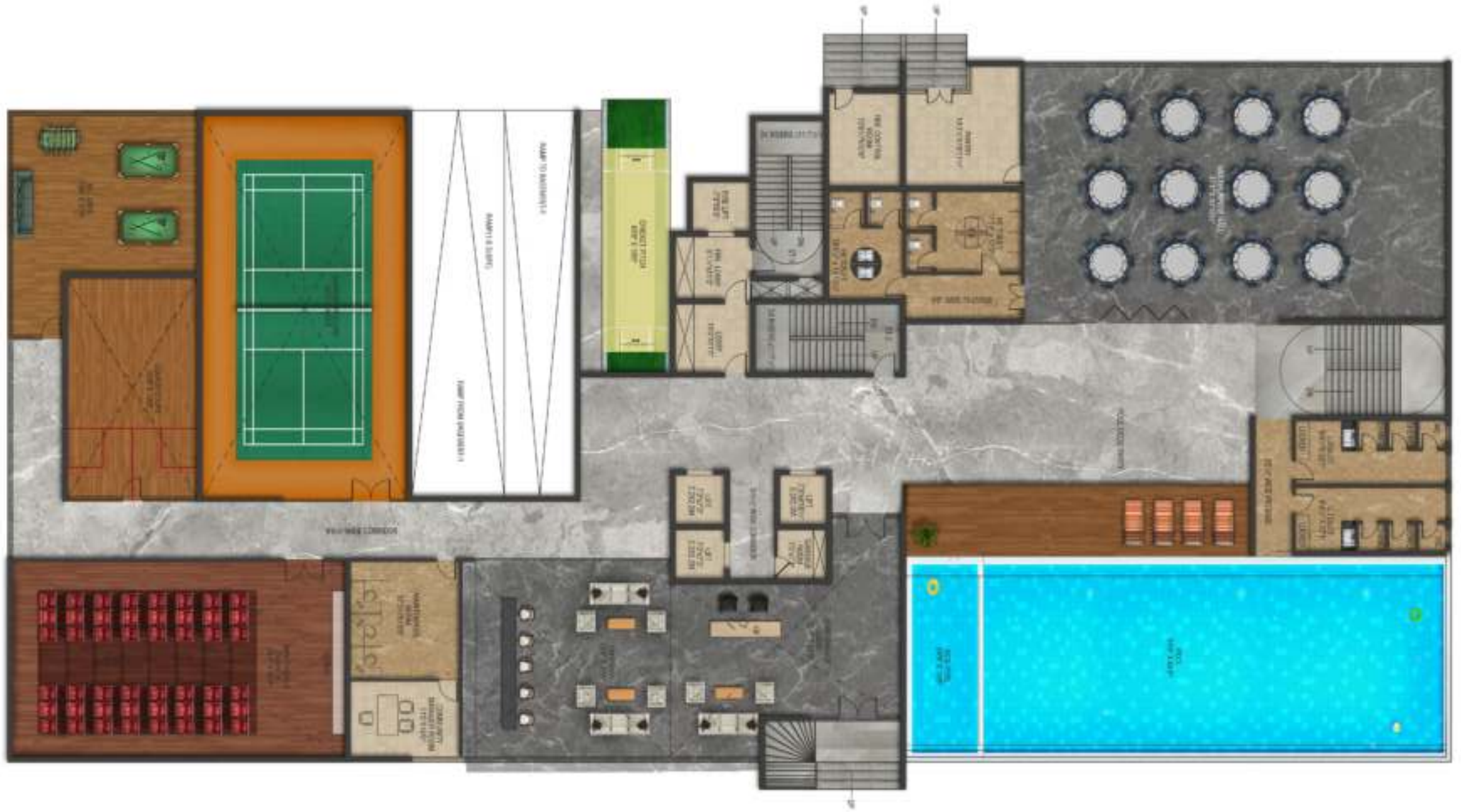
Club House Ground Floor Plan