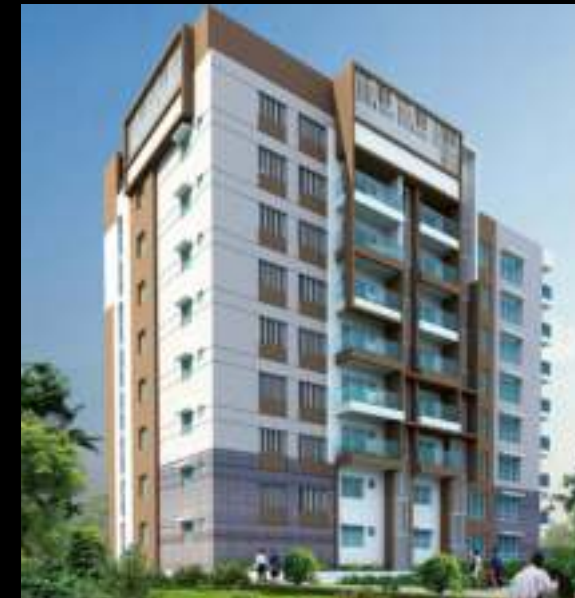
DSR REGANTI PHASE II