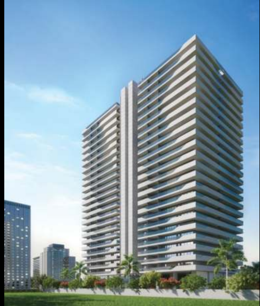
View from the north-east side