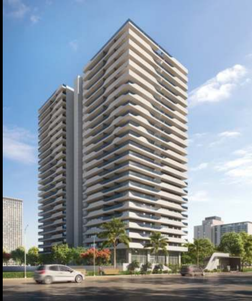
View from south-west side