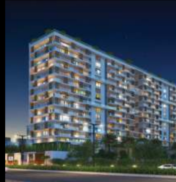
GVK SKY CITY