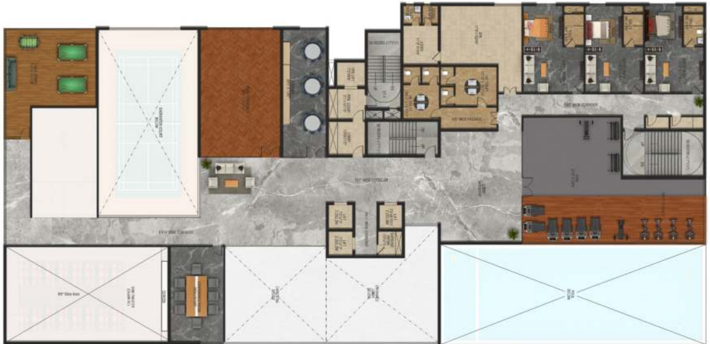
Club House First Floor Plan