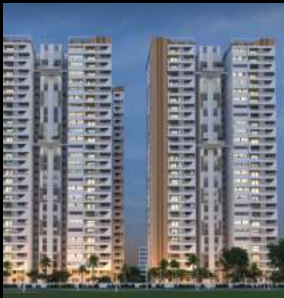
SONTHALIA SKY VILLAS