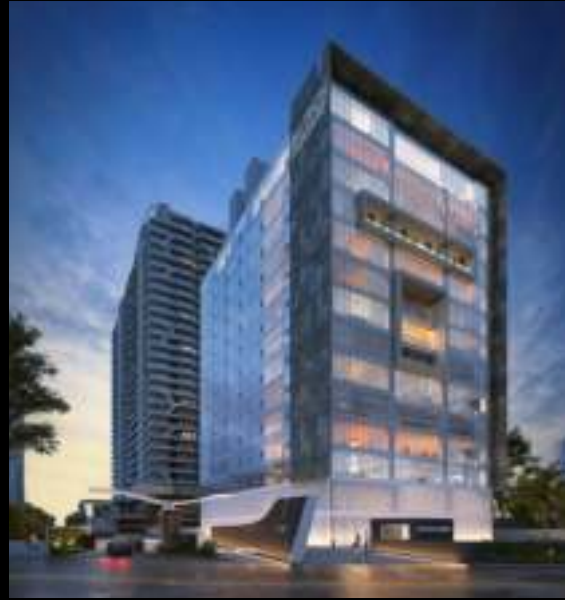
BN TECH SQUARE